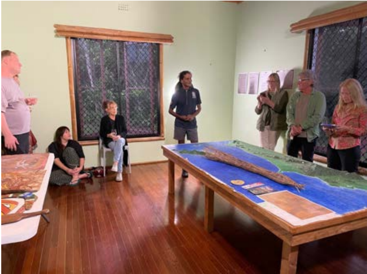
Image from 'Northern Conditions, Planetary Practices' workshop for regional art workers and environmentalists on Djiru Country at Ninney Rise, supported by UQ Art Museum and the Blue Humanities Lab.