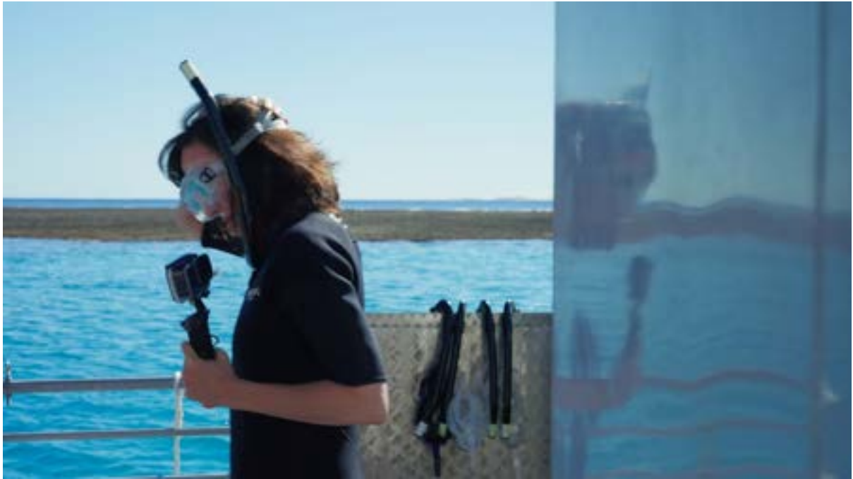
Filming Northern Waters, offshore of Lady Musgrave Island, Southern Great Barrier Reef, Sea Country of Taribelang Bunda, Gooreng Gooreng, Gurang, Bailai, and the Wakka Wakka and Auburn Hawkwood (Wulli Wulli) People.