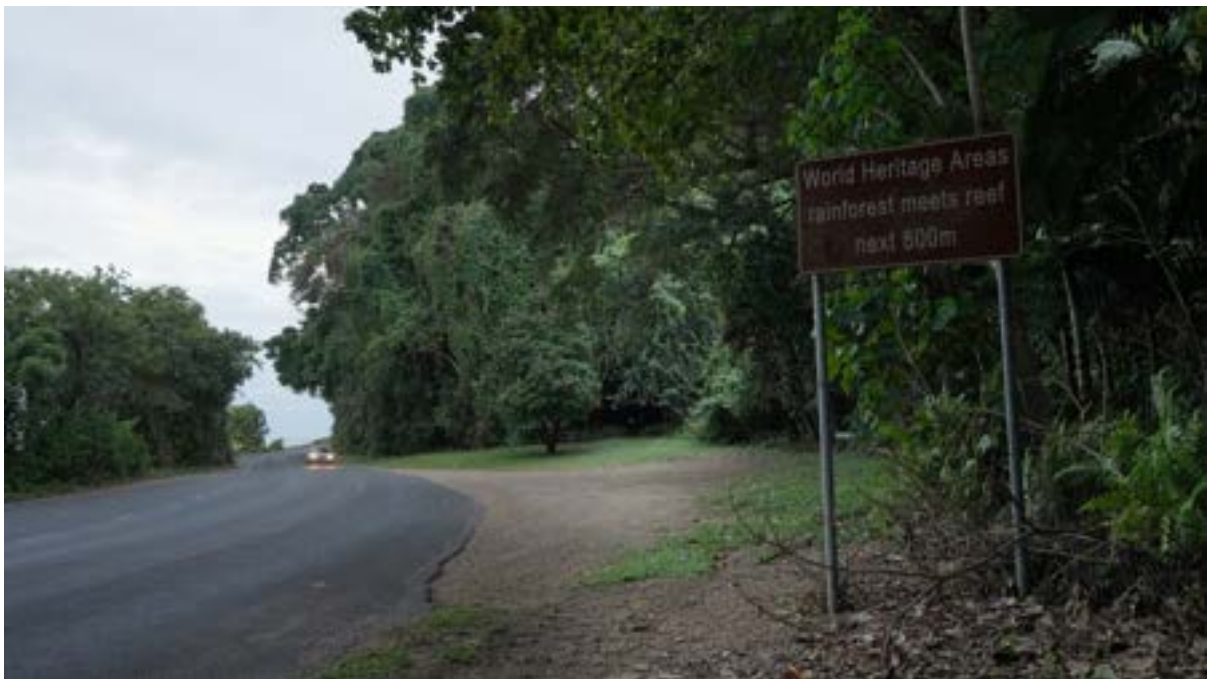
'Rainforest meets reef, next 800m', sign at Mission Beach, Djiru Country.