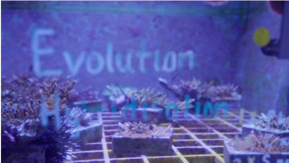
Close-up of coral breeding experiments at Australian Institute for Marine Science on Bindal Country, near Townsville.