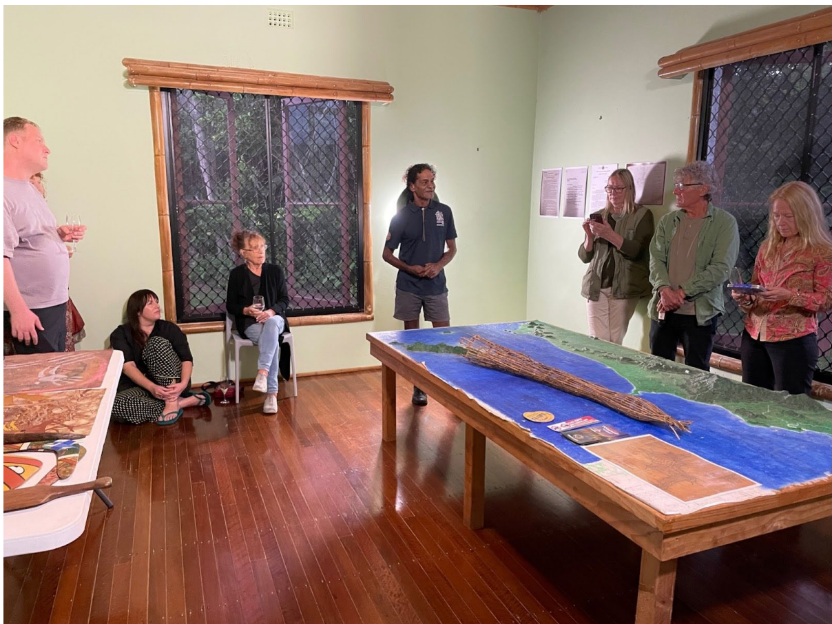
Image from 'Northern Conditions, Planetary Practices' workshop for regional art workers and environmentalists on Djiru Country at Ninney Rise, supported by UQ Art Museum and the Blue Humanities Lab.