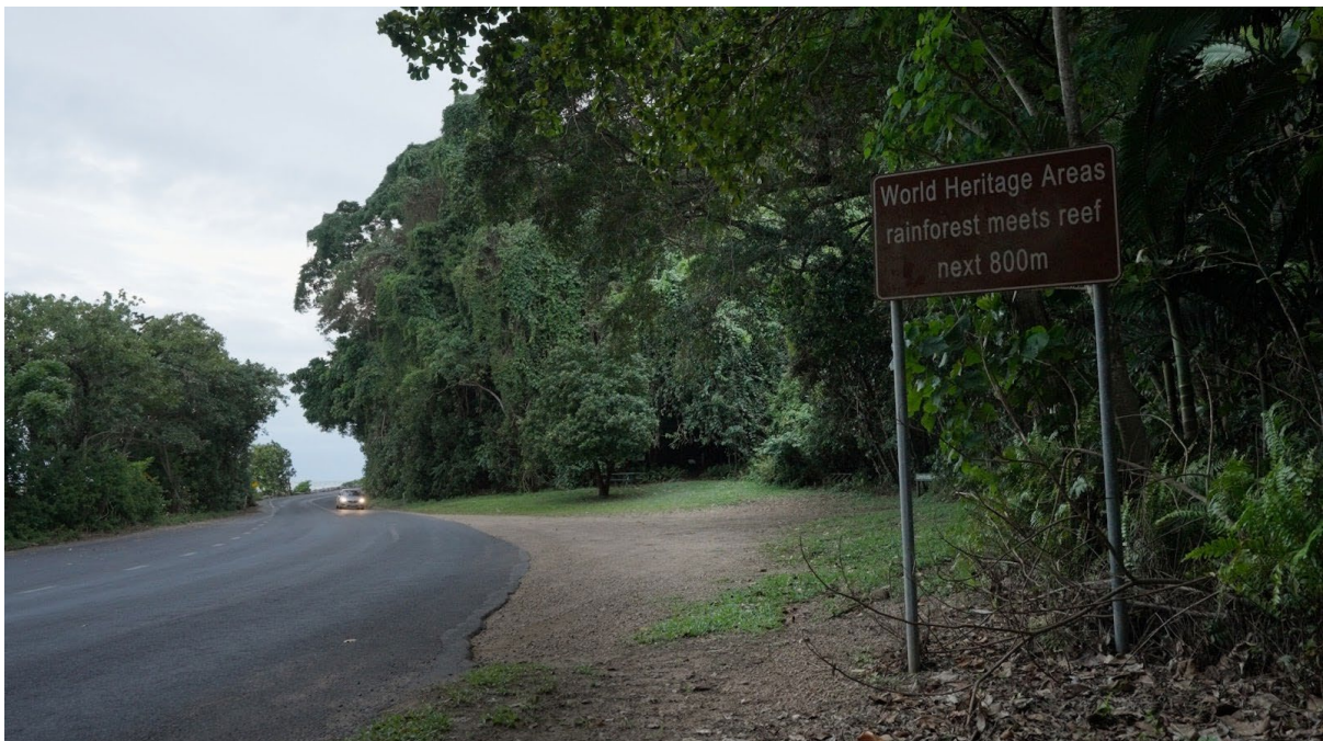
'Rainforest meets reef, next 800m', sign at Mission Beach, Djiru Country.