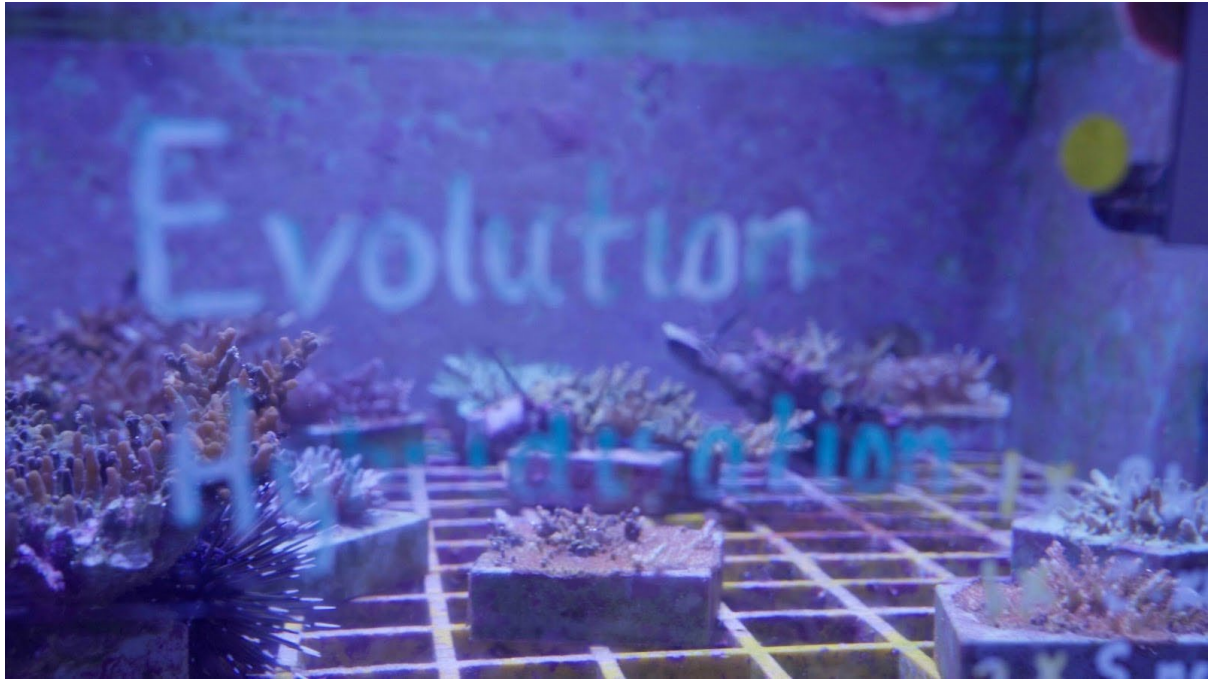
Close-up of coral breeding experiments at Australian Institute for Marine Science on Bindal Country, near Townsville.