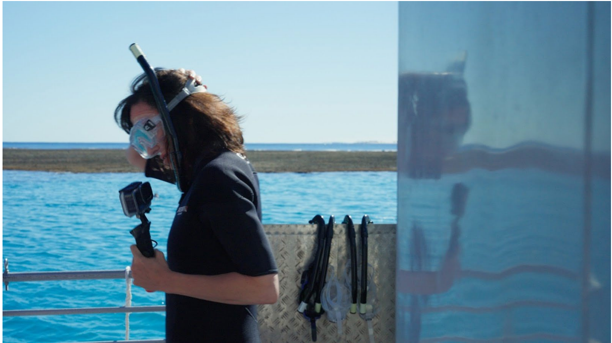
Filming Northern Waters, offshore of Lady Musgrave Island, Southern Great Barrier Reef, Sea Country of Taribelang Bunda, Gooreng Gooreng, Gurang, Bailai, and the Wakka Wakka and Auburn Hawkwood (Wulli Wulli) People.