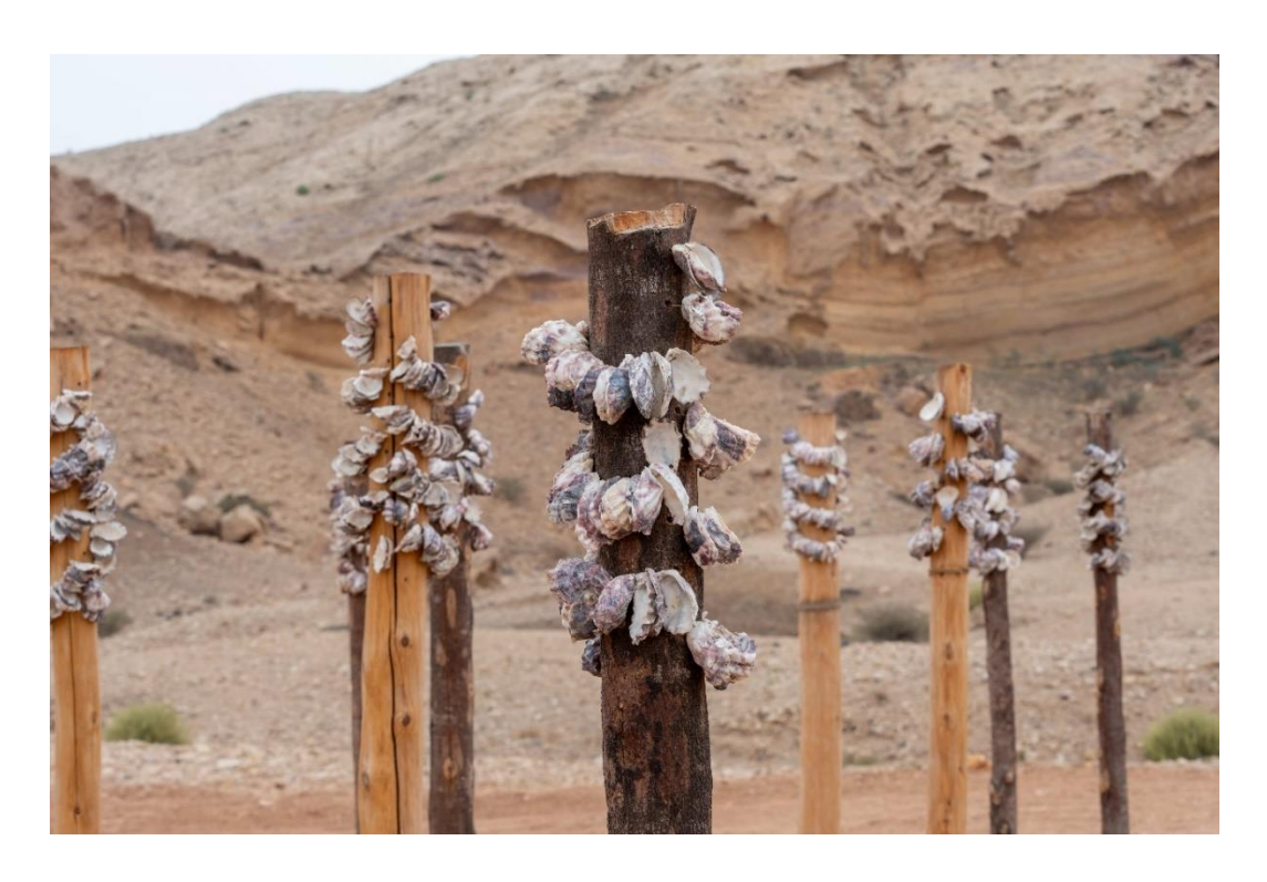
Megan Cope , Kinyingarra Poles , 2024, timber, kinyingarra (oyster) shells, stainless steel wire, steel base. Installation view: Sharjah Biennial 16, Buhais Geological Park, Sharjah, United Arab Emirates.